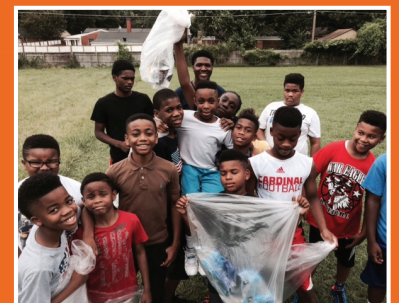
"I really had fun being with my friends and helping clean up."