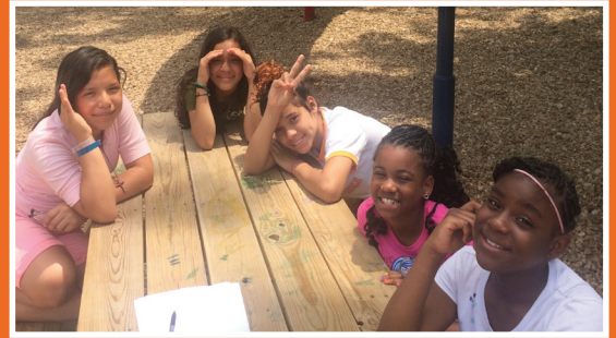
Being together for a week at camp has created camaraderie among the five MAM Leawood girls.